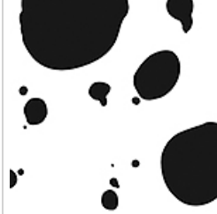
Op-Ed: The Good Driller Award