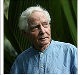
W. S. Merwin to Be Named Poet Laureate

Home | World | U.S. | N.Y. / Region | Business | Technology | Science | Health | Sports | Opinion | Arts | Style | Travel | Jobs | Real Estate | Autos | Back to Top