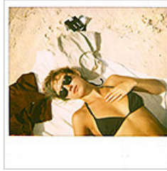
This Year's Model: Me