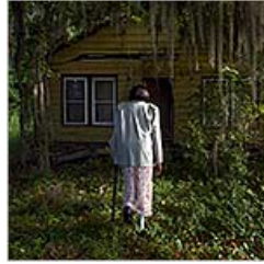
Black Landowners Fight to Reclaim Georgia Home